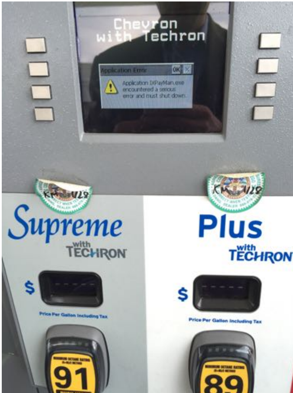
Figure 5: I found this gas pump had crashed, and was unable to pay at the pump. Imagine if a virus knocked out every gas pump simultaneously in the nation, or if a chorus of infected gas pumps began to unwittingly mount DDoS attacks on critical infrastructure.