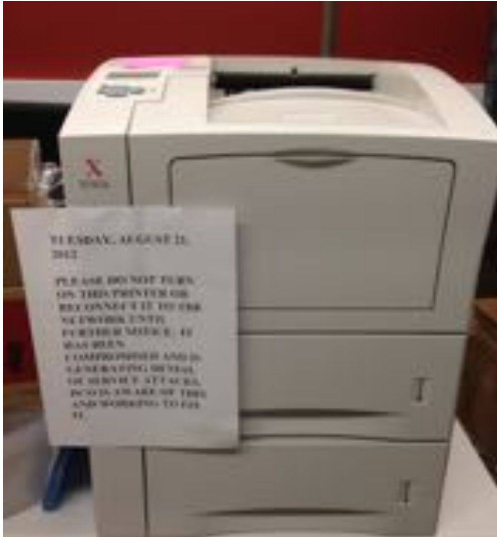
Figure 2: A smaller scale precursor to the Dyn DDoS attack, this printer at the University of Michigan was infected by network-based malware and began to generate denial of service attacks against other institutions.

In my travels, it disturbs me to find so many everyday devices as well as safety-critical devices without adequate cybersecurity controls.