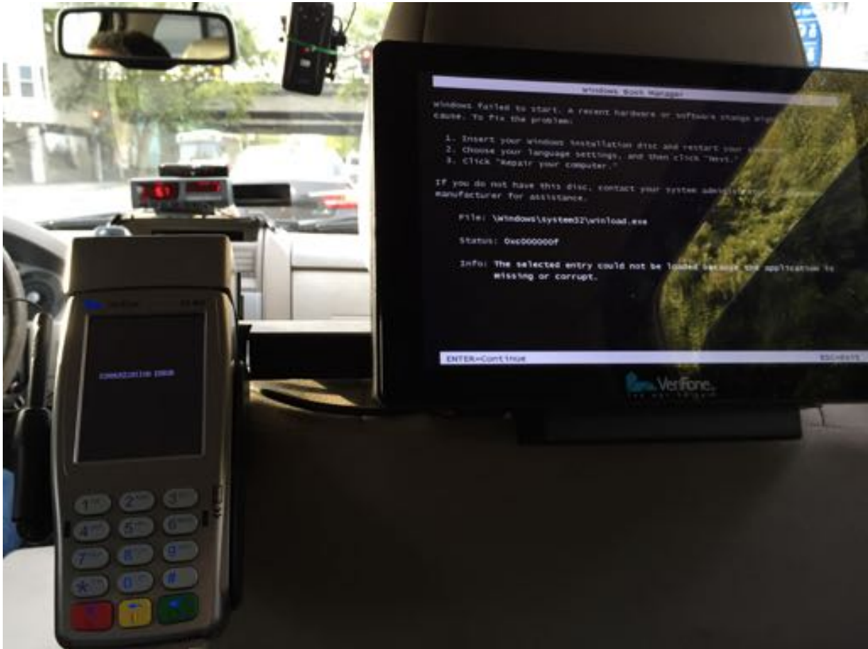
Figure 10: Even taxi cabs run on Windows. For the moment, the payments systems are separate from the engine control unit. But history shows that engineering mistakes happen, and one could imagine a vulnerability in an IoT payment system that causes massive disruption of transportation.