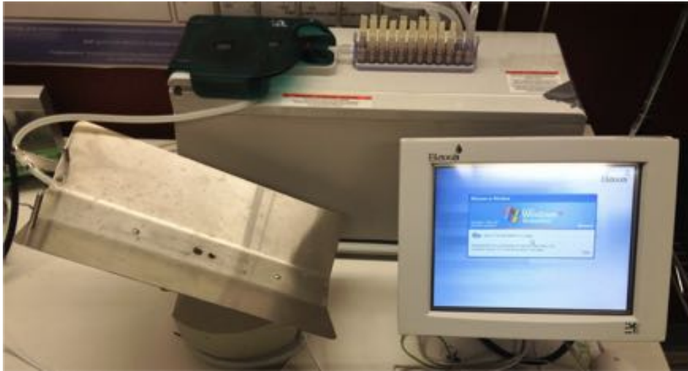
Figure 9: This is a pharmaceutical compounder from my lab at the University of Michigan. Hospitals use this device to mix custom, liquid drugs for IV delivery. FDA received a complaint that this model of compounder was infected with a virus. We found the machine to be running Windows XP, an insecure operating system. It was trivial to infect. A former employee of the company further explained that when the compounder was brought in for repair, the malware was accidentally spread to other compounders under repair.