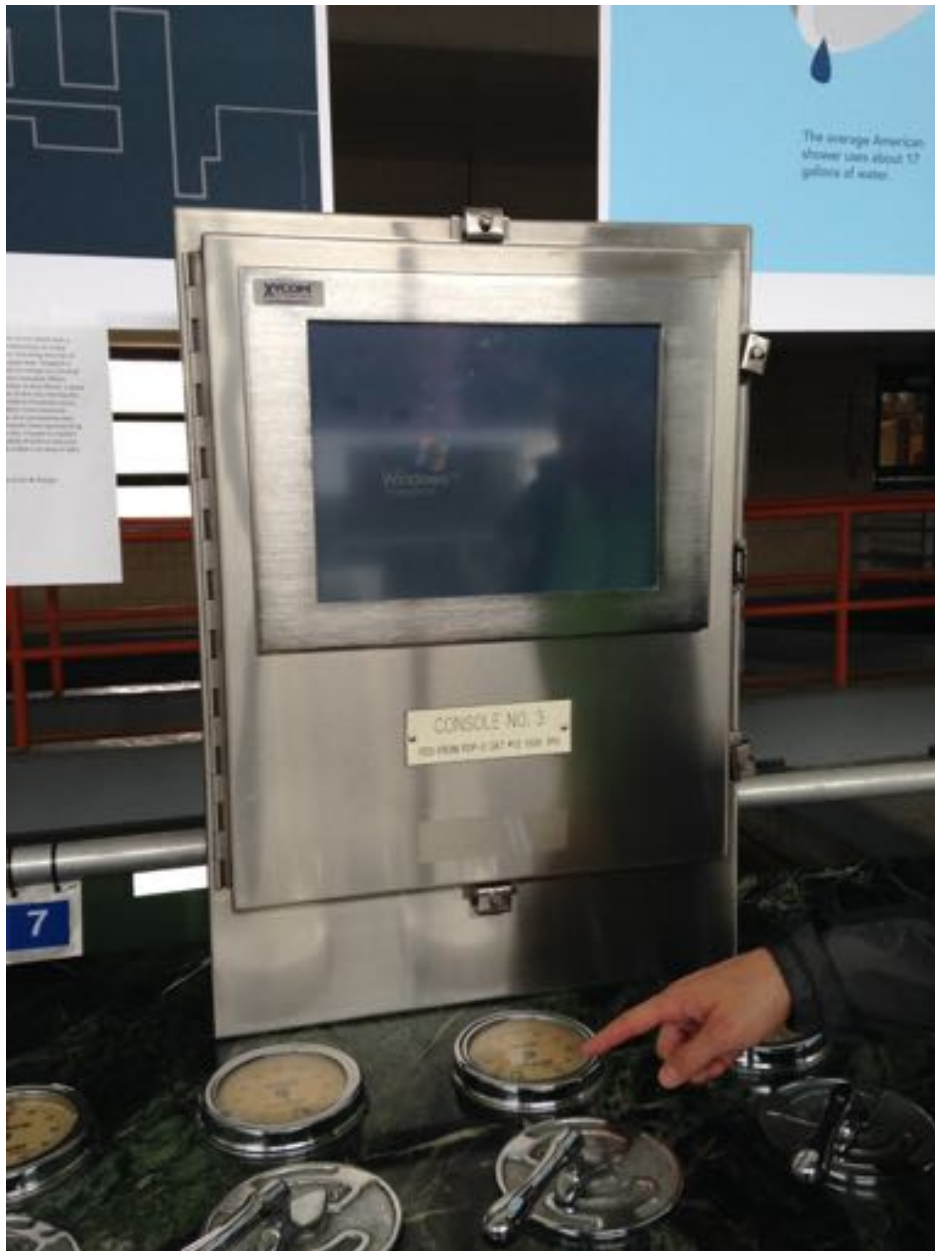
Figure 3: This water treatment facility in Michigan depends on insecure Windows XP for its water pump controls. In my photograph, you can see the Windows XP logo. Note that Windows XP ended security patch maintenance several years ago, and customers were advised of the expiration date before making purchases of the software. Windows XP machines are trivially compromised because there are no security fixes available and perimeter-based security provides little assurance.