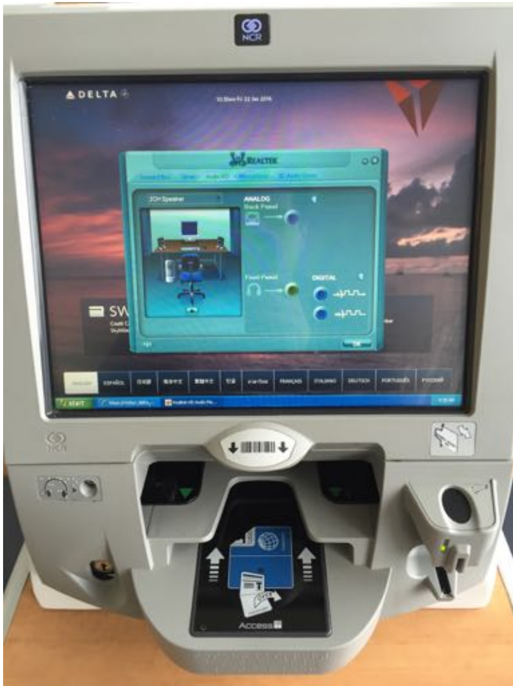
Figure 8: When checking in for a flight, I had difficulty because the boarding pass kiosk gave me a Windows GUI. Computing is everywhere, and we often forget how much we depend on hard-to-maintain software.