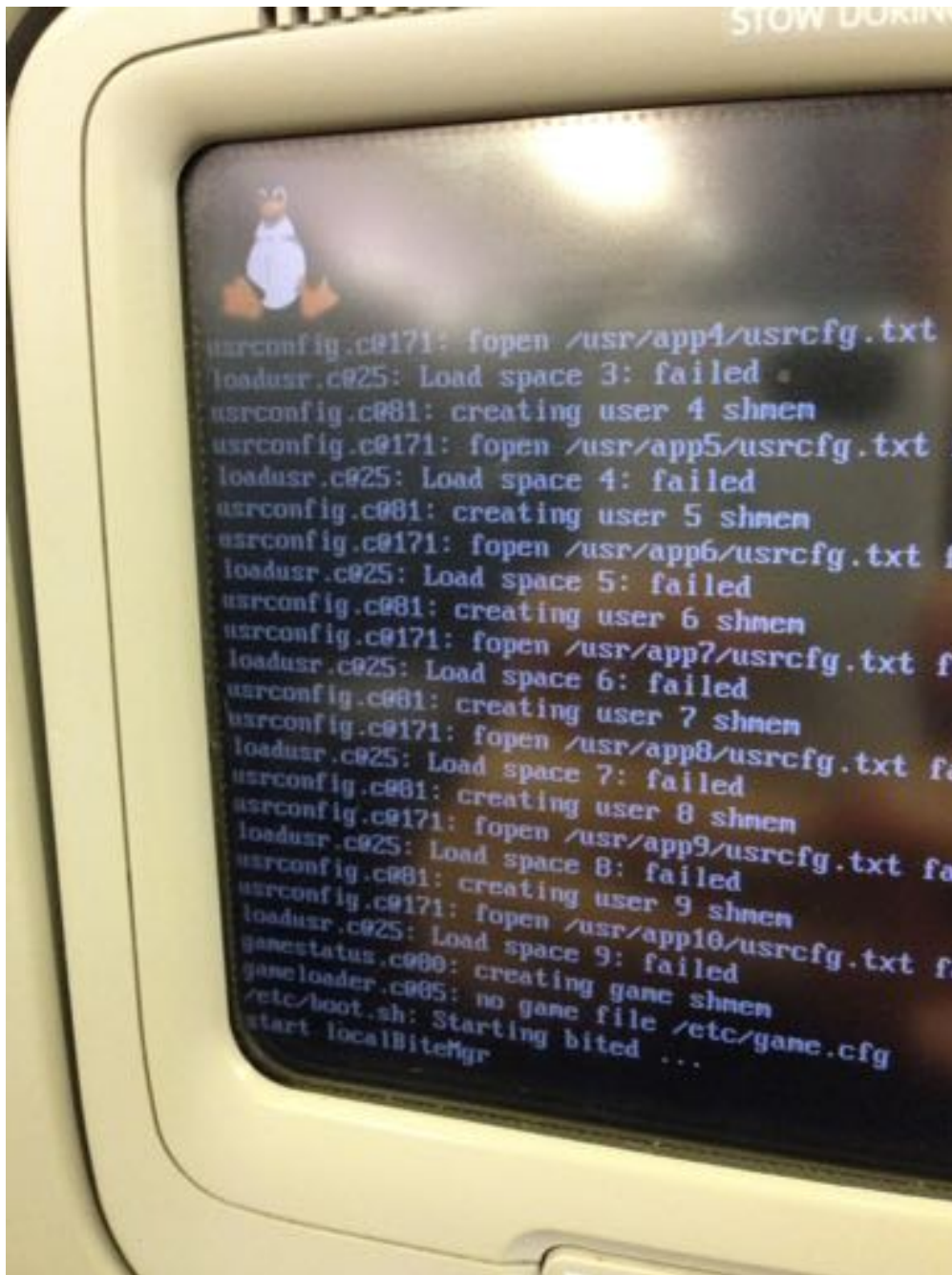
Figure 6: This airplane entertainment system running Linux crashed on my plane. While entertainment is not safety critical, imagine if flight control systems accidentally had a pathway to the entertainment software. Automobiles used to separate entertainment systems from engine control. However, a programmer eventually mixed the two systems unwittingly, enabling hackers to take control of an automobile by infecting the entertainment system.