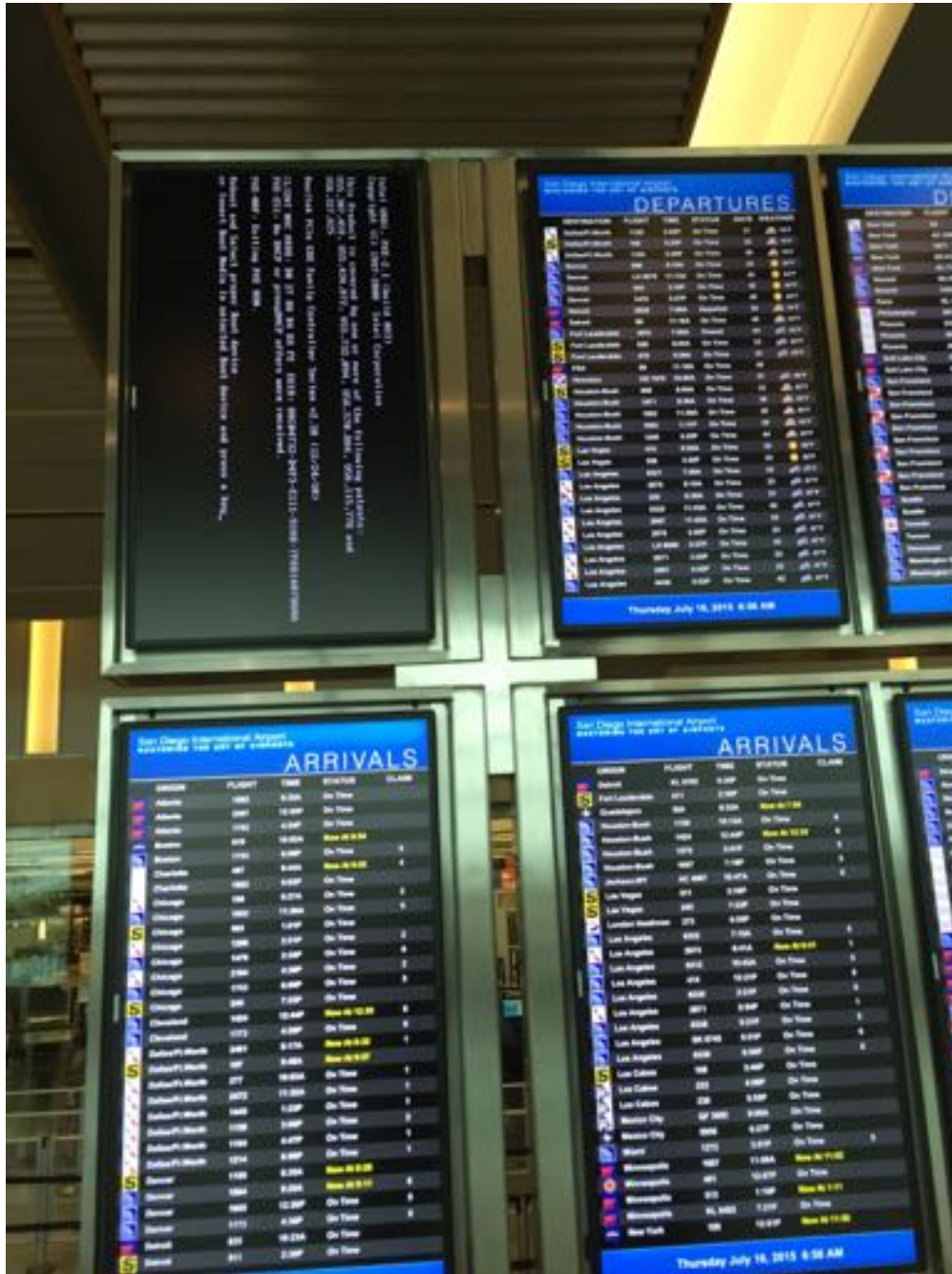
Figure 7: Crashed flight display consoles are a common occurrence in airports. Imagine if every smart TV in the world were simultaneously infected with a virus, sourcing a massive DDoS attack against a victim like Dyn.